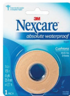
medical bandage tape